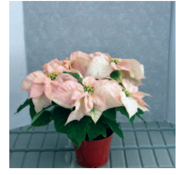
B-Nine / Cycocel as needed