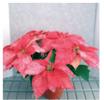
0.1 ppm Topflor as needed