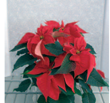
0.2 ppm Topflor as needed