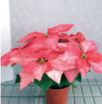
0.2 ppm Topflor as needed