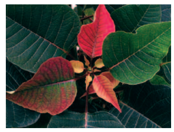
B-Nine / Cycocel as needed