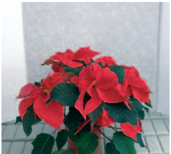
0.2 ppm Topflor as needed