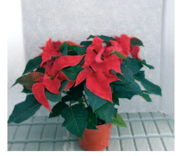
B-Nine / Cycocel as needed