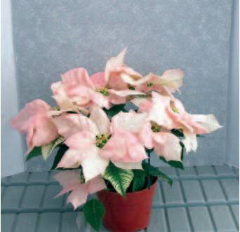
0.2 ppm Topflor as needed