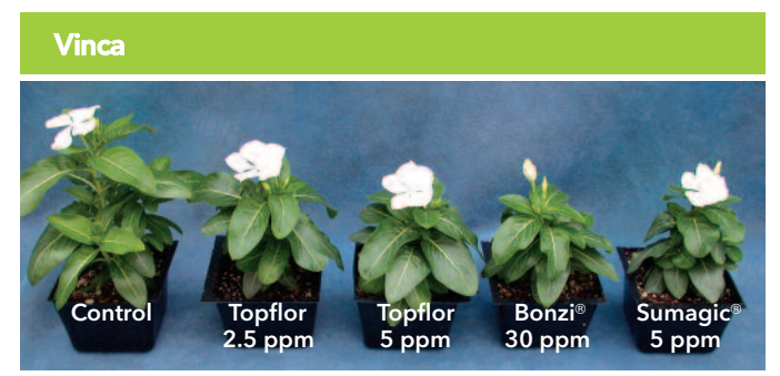
B. Whipker, NCSU

Drench: Apply to uniformly moist root media. Apply at a solution concentration at General Guideline Rates of 0.25 - 4 ppm at the recommended volume per pot (See Table 2, page 5 ). Rates for a specific plant species/cultivar and set of use conditions should be determined in small-scale treatments prior to large-scale applications. The user should determine optimum rates noting that the listed rate range encompasses production in the warmer and cooler climates.