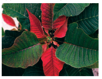
B-Nine / Cycocel as needed