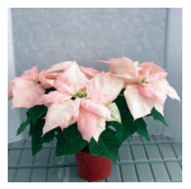
0.1 ppm Topflor as needed

Visions of Grandeur at Finish (Images taken December 5, 2007)