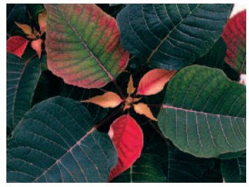
0.1 ppm Topflor as needed

Prestige Early Bract development of Poinsettias following PGR applications. (Images taken November 14, 2007)