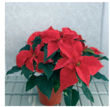
B-Nine / Cycocel as needed