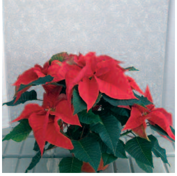
0.1 ppm Topflor as needed