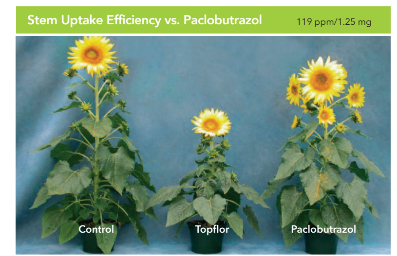
B. Whipker, NCSU