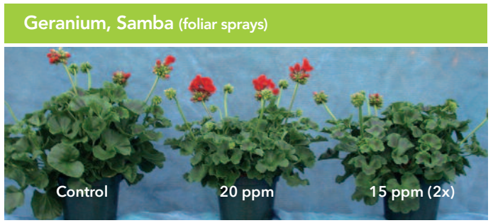
B. Whipker, NCSU

Topflor is effective when applied as a spray or drench on a wide variety of flowering and foliage plants.