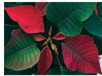
0.2 ppm Topflor as needed