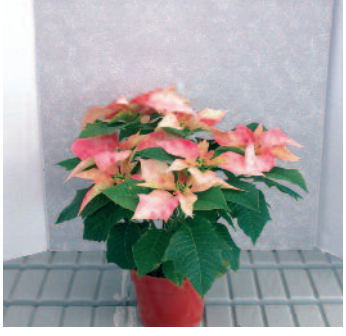
B-Nine / Cycocel as needed